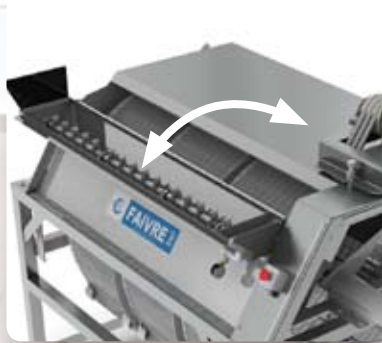
Reversible cleaning sprinkler unit.