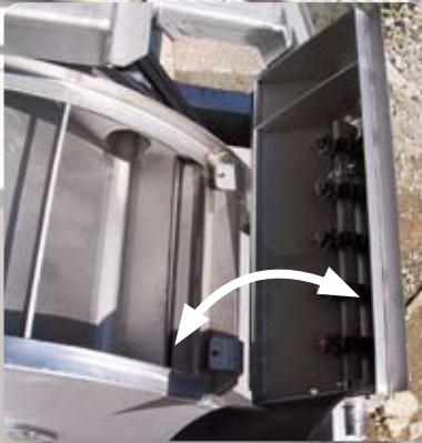
Reversible cleaning sprinkler unit.