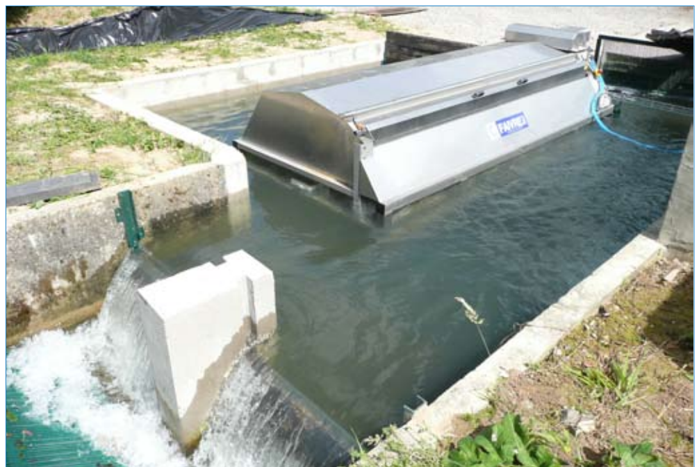
Drum filter 32-160

Pictures and technical data are not contractual. FAIVRE Sarl can bring any modification to its equipment at any time.