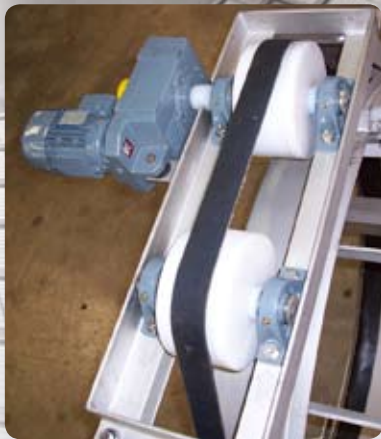
simple and robust drum driving system.