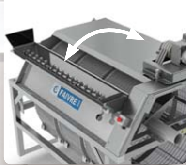
Reversible cleaning sprinkler unit.