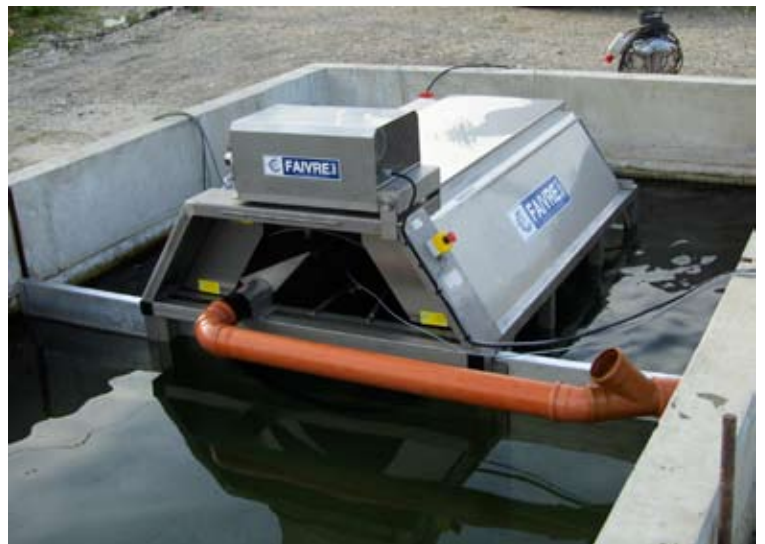
Drum filter 9-120 at outlet fish farm

Pictures and technical data are not contractual. FAIVRE Sarl can bring any modification to its equipment at any time.