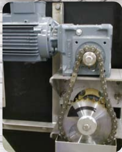
Drum driven by chain.