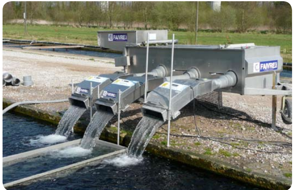
Fish Grader Helios 50 coupled with 3 Fish counters Pescavision 30.

Pictures and technical data in this document are not contractual . FAIVRE Sarl can also bring any modification to its equipment at any time.