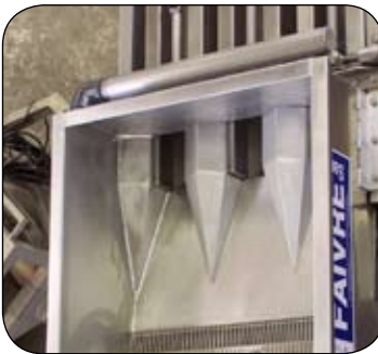
Inside inlet hopper view