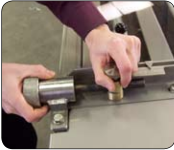
Adjustment vernier (SpsTechnology)