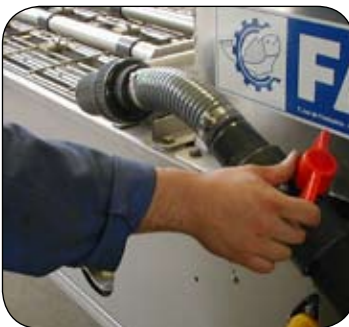
Water flow regulating with valves