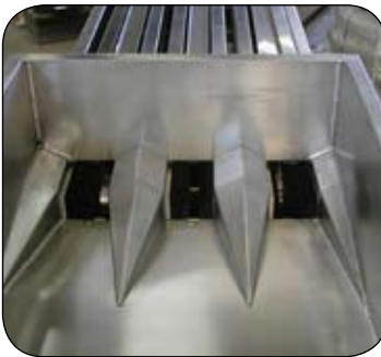
Inside inlet hopper view