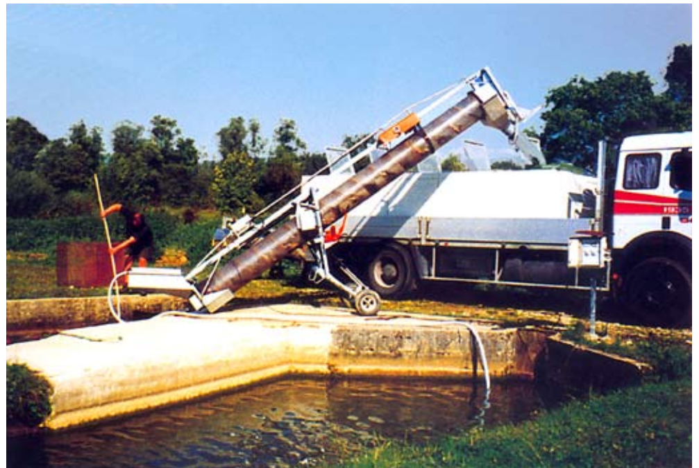
85 CLASS elevator Ø330mm - 5m length with a frame handling assisted by hydraulic device.

Pictures and technical data are not contractual FAIVRE Sarl can also bring any modification to its equipment at any time.