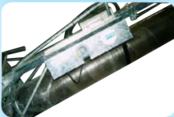
Motor with speed variator