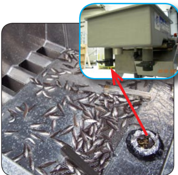
Inlet hopper with special system to plug a fish pump.