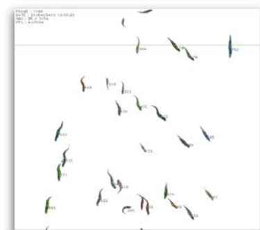
Movie for verification

Pictures and technical data are not contractual. FAIVRE Sas can bring any modification to its equipment at any time.