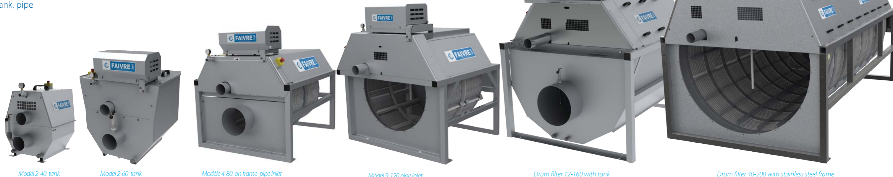
Model 2-40 tank

The 200 series has been designed for huge fish farms where there are strict requirements for the filtration of outgoing effluent flows, large recirculation system.