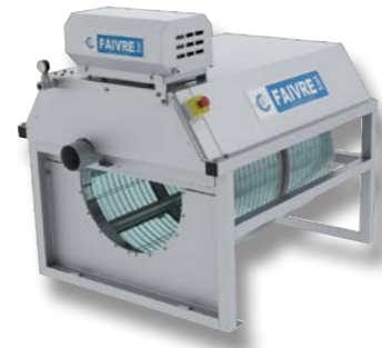
Filter with frame