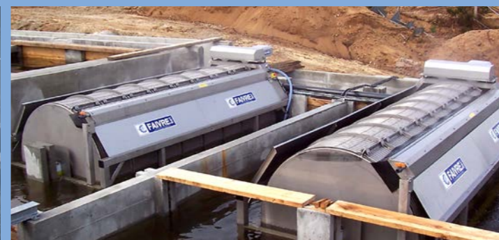
View on 2 filters 32-160 with frame in sturgeon farm