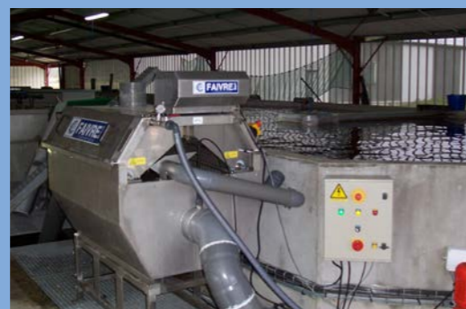
Model 4-80 with 36µ mesh on recirculation system.