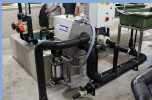
Model 2-40 with 36µ mesh on recirculation system.