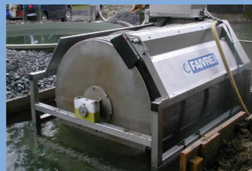
Model 9-120 with frame (outlet fish farm)