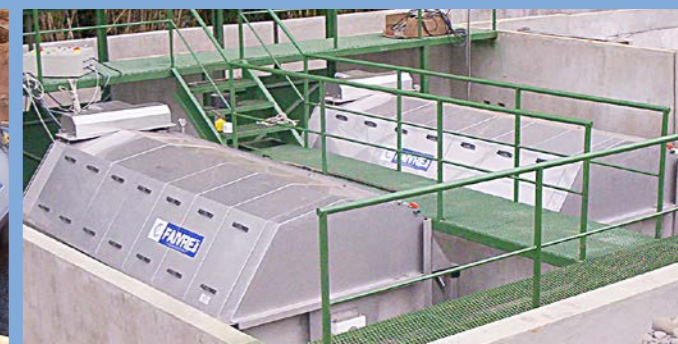
View on 2 filters 28-160 with frame in outlet fish farm