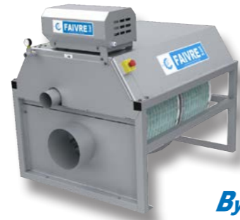
Filter with input by pipe