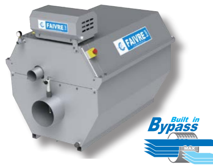
Filter with tank