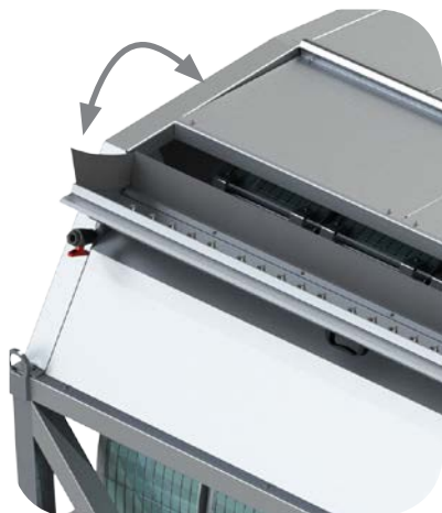
Reversible cleaning sprinkler unit.

Data given with 0,8 meter/seconde water speed max.