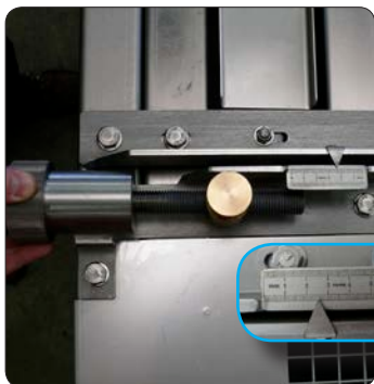
Accurate adjustment vernier.